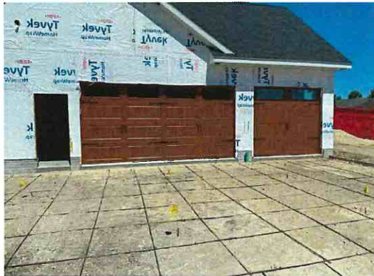
11 Serenity Circle