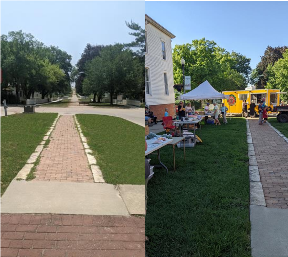
Heritage Square Park showing link to Hoover Presidential Library and the West Branch Farmer's Market.

Heritage Square is located at the intersection of Main and North Downey Street, in the heart of historic downtown West Branch. You can also access the Herbert Hoover National Park and Museum also known as the Downey Trace from Heritage Square. The park is used for the local farmers market, festivals and other City events.