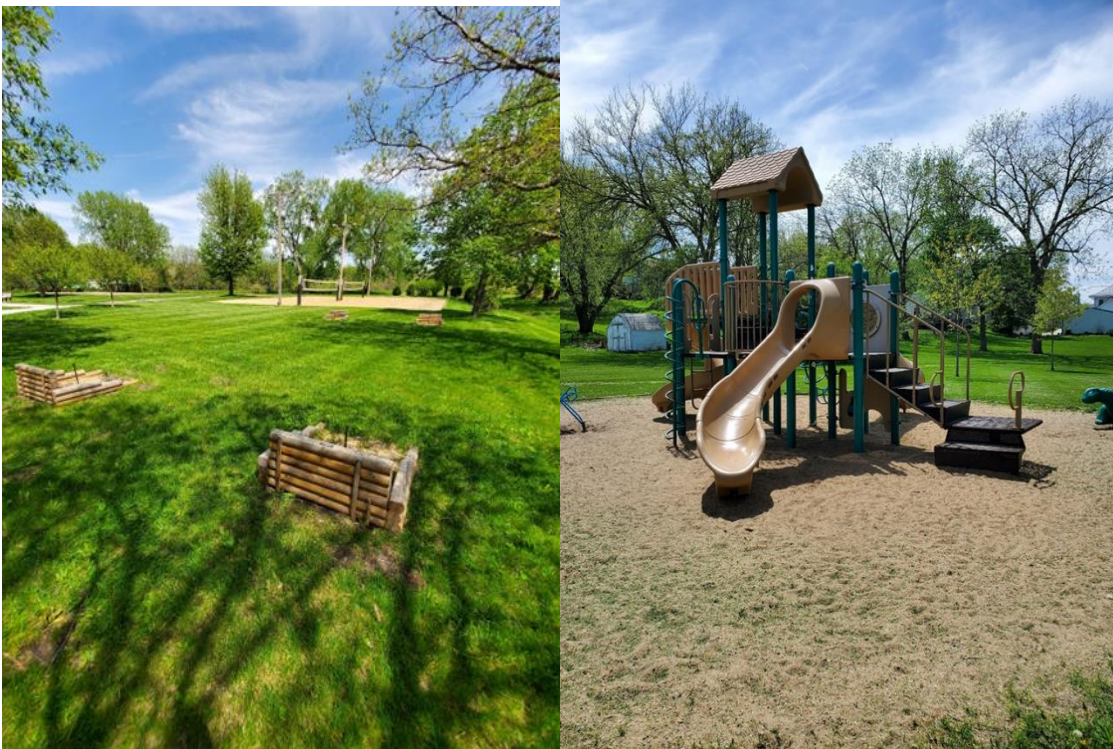
New play equipment at Beranek Park and Sand volleyball courts at Beranek Park