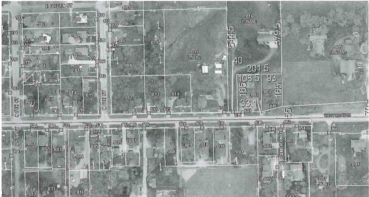
Red: West Branch Underground Railroad Preservation District, selected property is known as Townsend's Traveler's Rest.